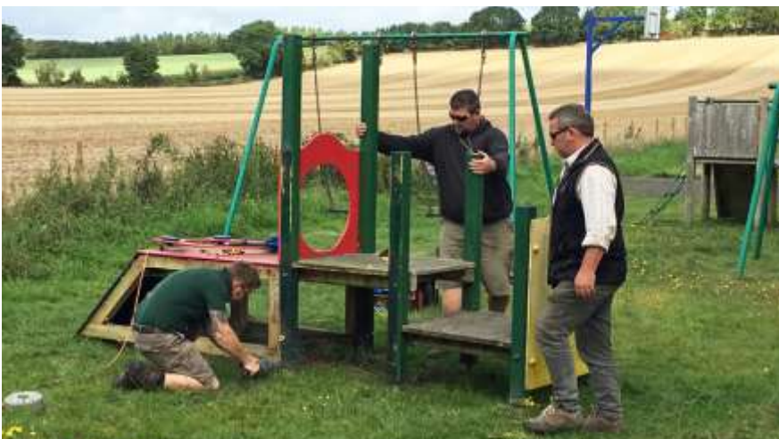
The Play Train is removed

The old Play Train in the Children’s Play Area had now been removed thanks to the hard work of Cllr Ali Thorne, Lee Curtis and Dan Down. The construction of the new Children’s Play Trail would begin in the week beginning 16 th September. The “basket” seats on the junior swings were also being replaced and the frames would be repainted.