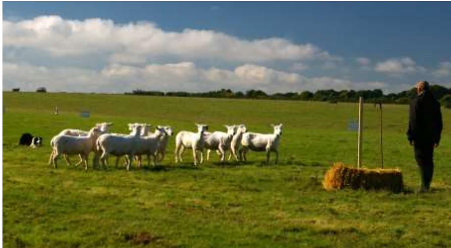
Sheepdog and handler in action at the sheepdog trials