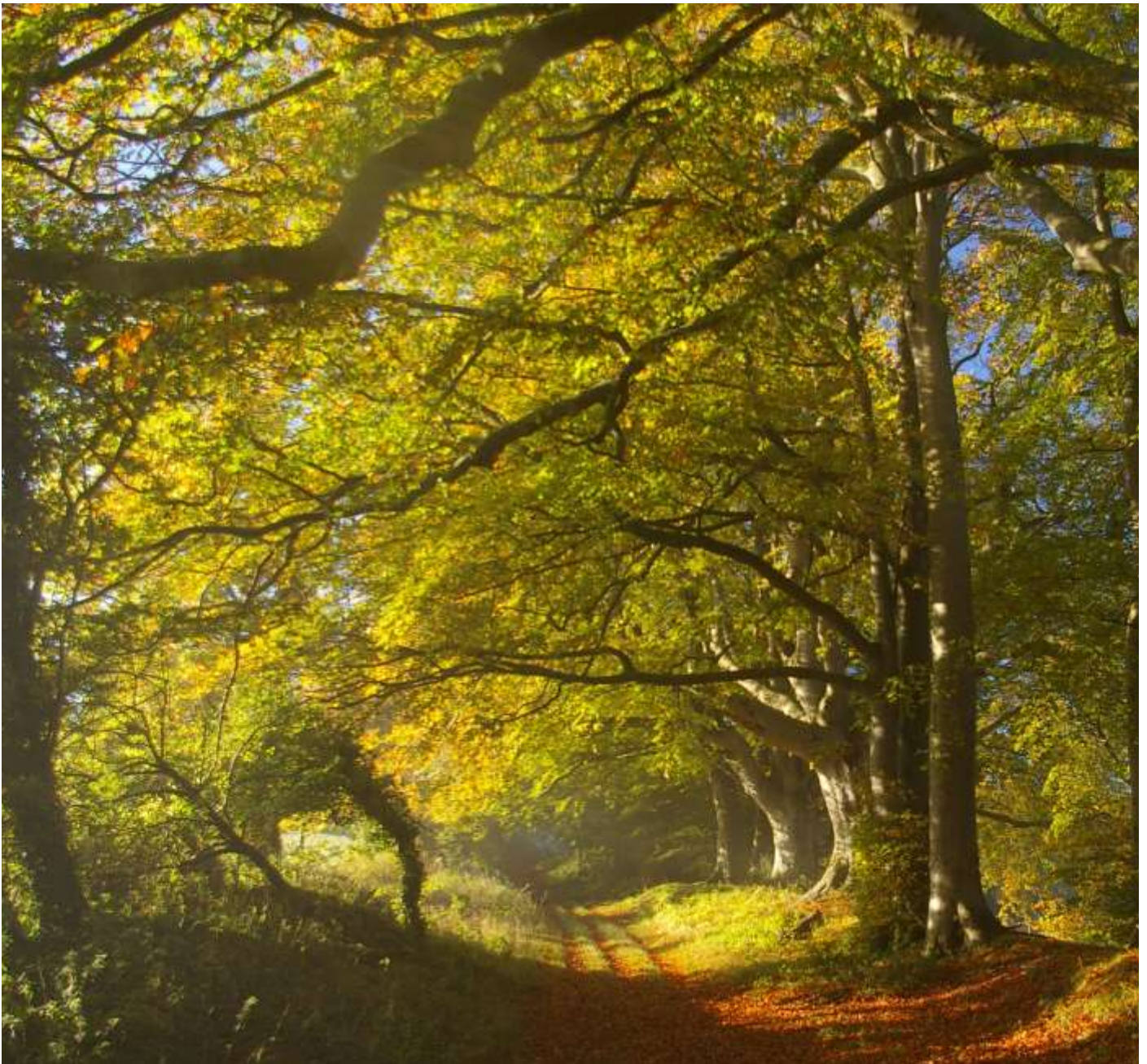
The Beeches in Autumn