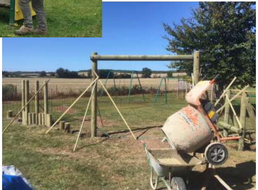
The Play Trail is installed