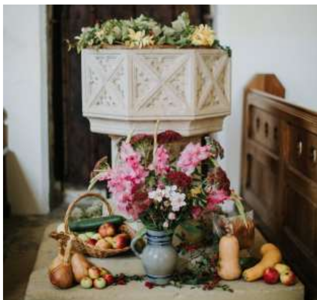
Bishopstone Harvest 2018

The editors reserve the right to edit all contributions.